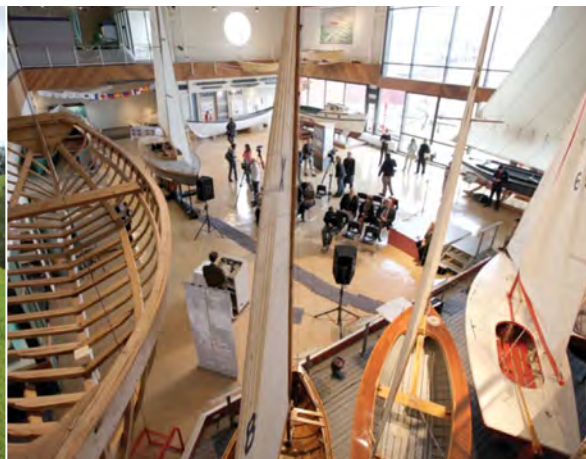
Summer Institute 2013, Halifax. Participants visiting the Maritime Museum of the Atlantic.

We also created a variety of successful workshop models (see Highlights 2013). As our catalogue of print and on-line teacher resources expanded, we were able to deliver more efficient and more effective workshops.